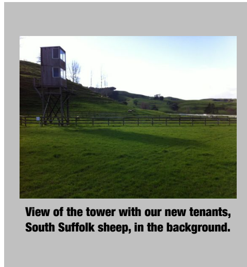
View of the tower with our new tenants, South Suffolk sheep, in the background.